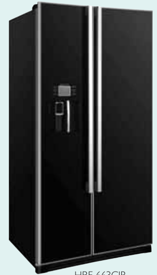
HRF-663CJB crystal black