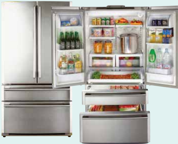
HB21FWNN / HB21FCBAA crystal black