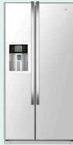
HRF-663CJW crystal white