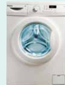
HW80-1230D / HW70-1230D